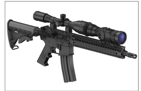
Clip-On (In-Line) Sight

Clip-On Adapter Required, Scope Adapter Optional (Configuration-Dependent)